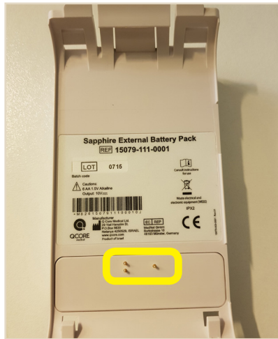
Sapphire External Battery Pack